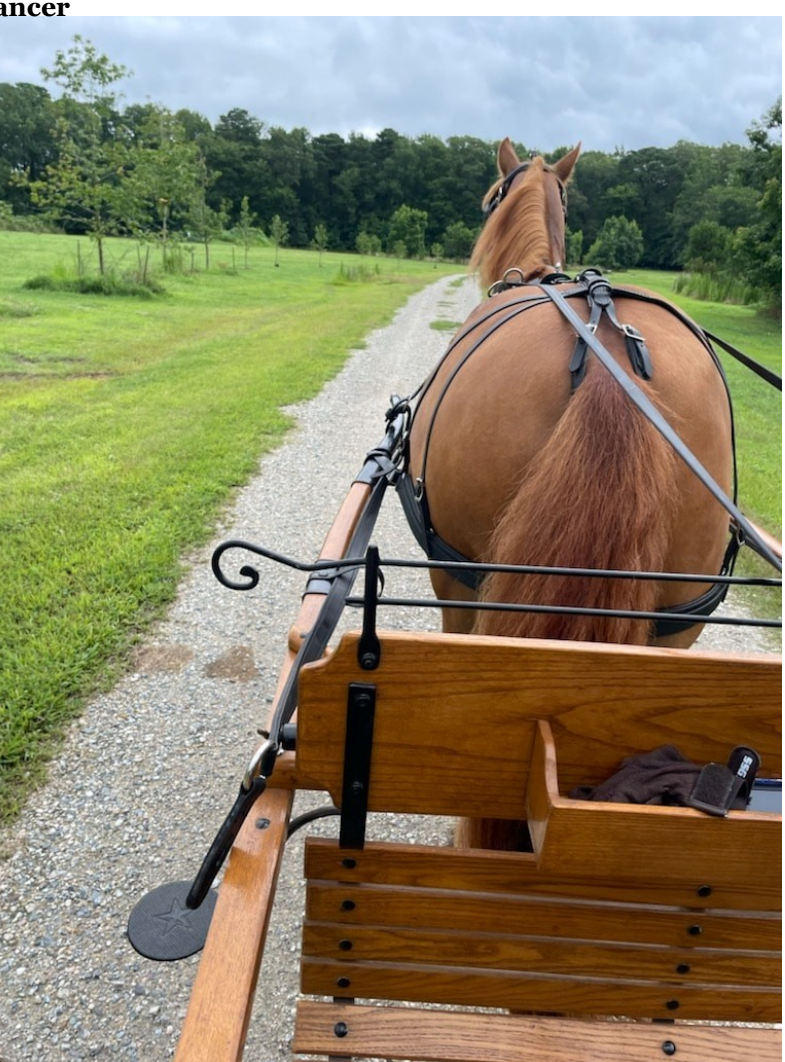
Shannon Gandee driving Beau