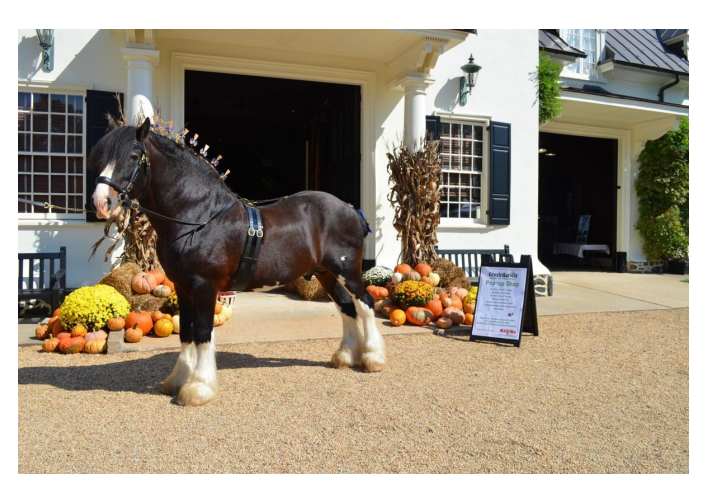
Aryshire Farm Shire Horse

Aryshire Farms is a unique farm located in Upperville, VA. Their mission is to bring livestock and crop production to both self-sufficiency and profitability. Among the animals residing at the farm are such rare breeds as: Shire horses, Scottish Highland cattle, Ancient White Park cattle, Gloucestershire Old Spot hogs, and several breeds of free-range chickens, turkeys, and ducks. Pheasants and wild turkeys are raised for release into the farm woodlands, areas which are being replanted and managed so as to provide "wildlife corridors" among the various habitat areas. Native trees, plants and grasses are being re-introduced as woodland cover, hedgerows, and fodder crops. Aryshire Farms Shires participate in Draft and Pleasure Driving Shows.