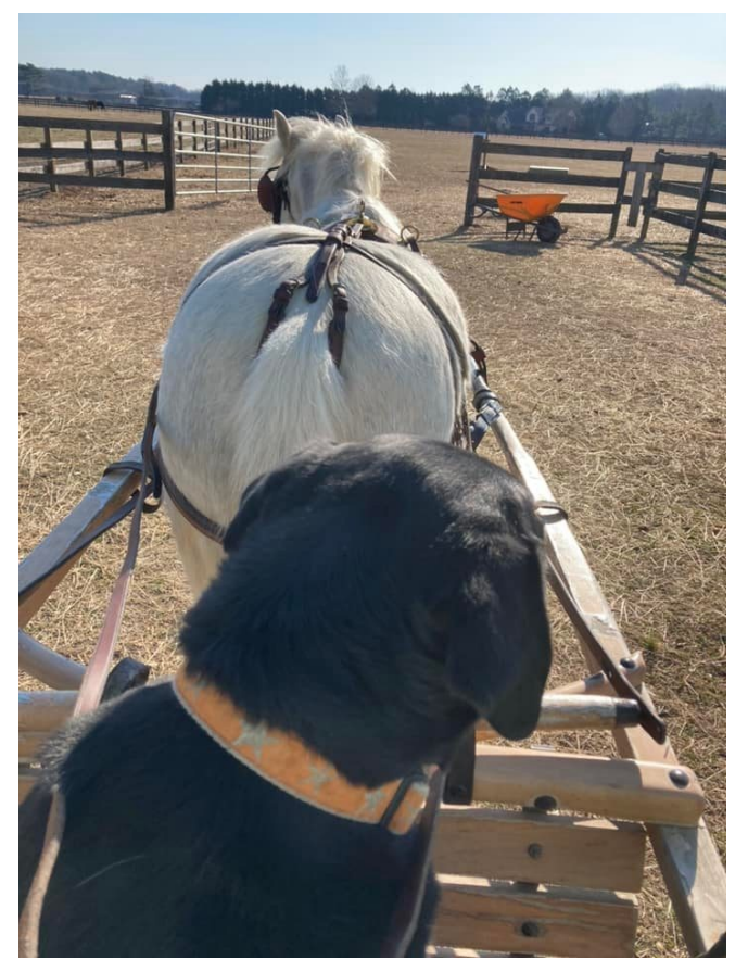
Michele Brauning driving Kemba as Tank catches a ride