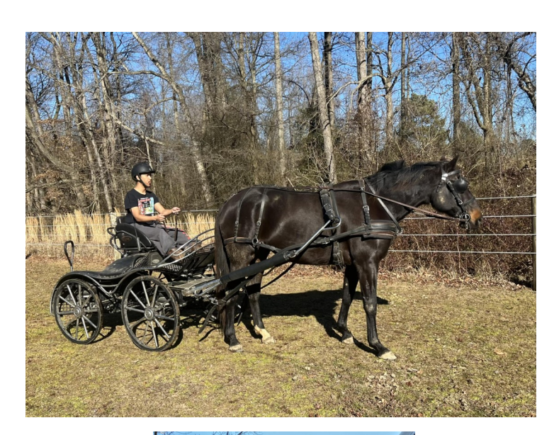
riding one of her