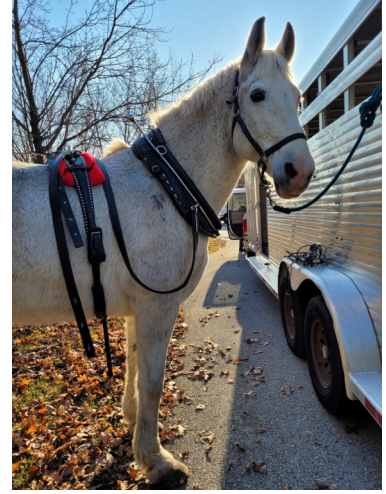
Howie getting ready to go to work