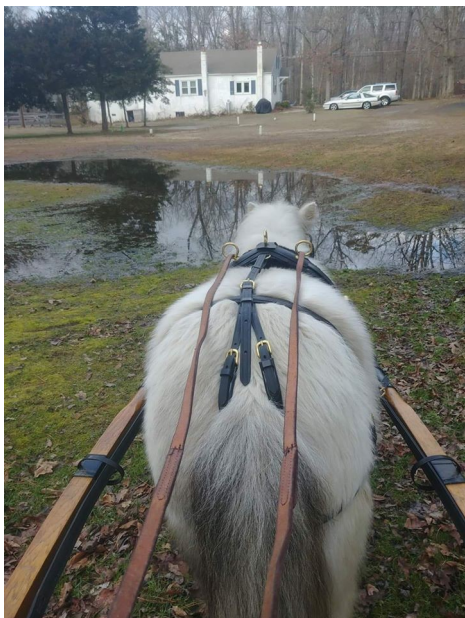
Maddy Zacharkow and Starlight facing the 'water hazard'