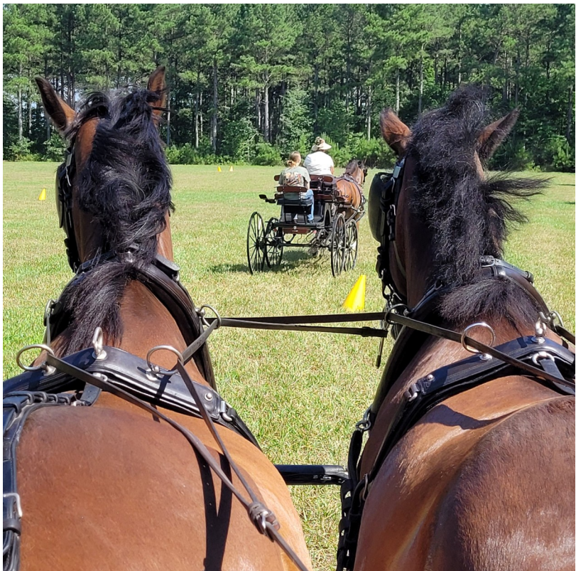
Driving the Baker's Canadian Crossbreds at Hollyville Farm arena